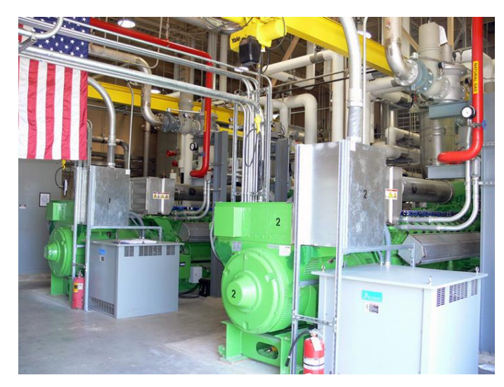
Figure A1. Cogeneration facility at BCUA's Little Ferry Water Pollution Control Facility.