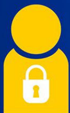
Data Protection Officer (DPO)